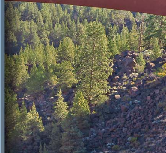
The 2015 Dodge Viper rules the road on US 97, passing over the gorge at Peter Skene Ogden State Park north of Terrebonne, Oregon, oblivious to hundreds of feet of open air below.