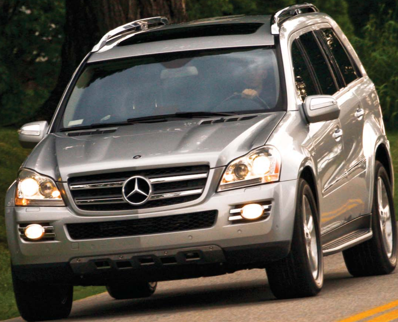
Mercedes-Benz GL320 BlueTEC

tion for diesel drivetrains. For all these reasons, Mercedes-Benz chose the US for the worldwide debut of BlueTEC technology in the E320 BlueTEC, as well as the launch of its latest BlueTEC system with AdBlue injection.