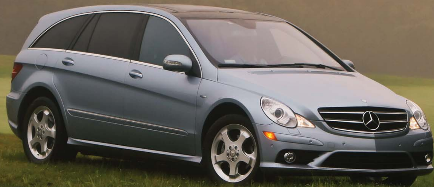
Mercedes-Benz R320 BlueTEC

ranges. All come with the PRE-SAFE predictive occupant protection system and Active Front Head Restraints. A new-gen telematics system boasts an improved user interface and a host of new functions. A hands-free system with integrated Bluetooth is standard, as is a port for your iPod or other device. An optional Universal Media Interface lets you connect an external music storage device to on-board electronics, so you can display and select track titles on the instrument cluster, center console screen and multi-function steering wheel (while charging the device's battery). Another package adds HD and SIR-IUS radio, plus optimized voice recognition.