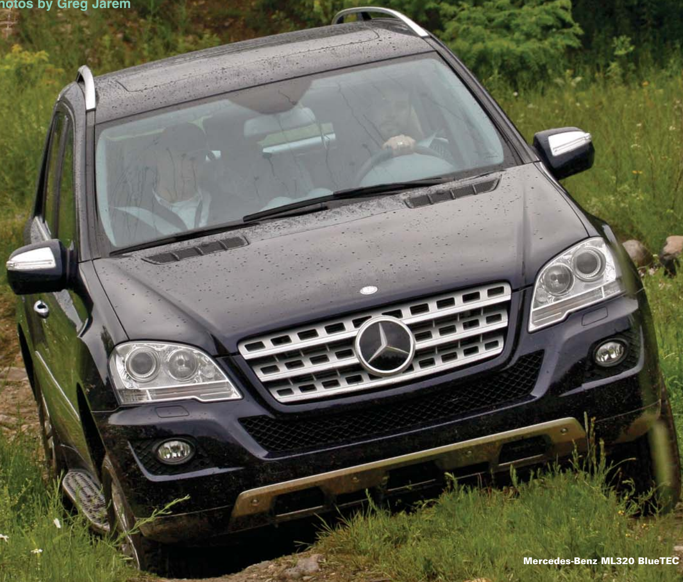
Mercedes-Benz ML320 BlueTEC

Mercedes-Benz is acutely aware of their timing in the announcement of a newly expanded BlueTEC lineup, now comprising three of their most popular SUV/crossover products, the ML320, GL320 and R320. The good news is that customers are hotly seeking alternatives to the gasoline pump. The tougher news is that diesel has been running about a dollar higher per gallon than gasoline, five-plus bucks against four-plus, or a good 25% higher.