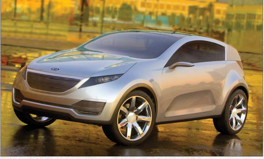
The Kia Kue concept, unveiled in Detroit, is a strong indicator of the company's design direction.

Riding the crest of 13 straight years of record sales in the US, Kia is intent on getting its brand message more widely into the American psyche. Their philosophy is that brand perception equals what is delivered versus what has been promised. Knowing they hold a strong hand, their motto appropriately is "The Power to Surprise." Kia is intent on letting people know not only about its vehicles' value, but also their quality and safety ratings, and not least their fun-to-drive character. (Kia considers it offers a more