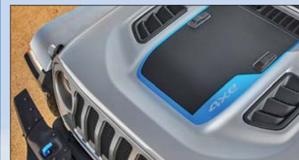
Jeep Wrangler 4xe chassis & powertrain // Rubicon 4xe

tion and Islander Edition models. Driver assist tech inclusions and infotainment systems are all upgraded, and style, utility and comfort features are boosted, with special attention to the Trailhawk.