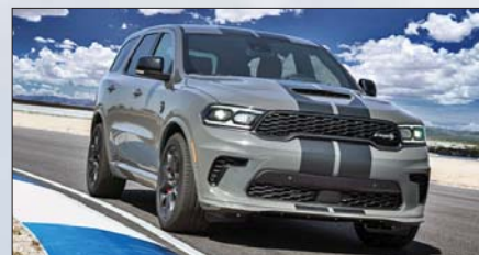
Dodge Challenger SRT Super Stock // Dodge Charger SRT Hellcat Redeye // Dodge Durango SRT Hellcat

stitching and many more special touches.