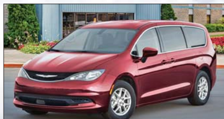
Chrysler 300S with Red S Appearance // Chrysler Voyager

ance-focused lineup while defining Chrysler nicely.