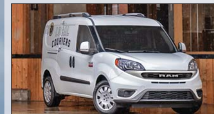
Ram 1500 Laramie Longhorn EcoDiesel // Ram 2500 Heavy Duty Longhorn Mega Cab // Ram ProMaster City

power-fold trailering mirrors with or without 360-degree surround view, trailer light and tire check system, Off-Road Pages, and upgraded pedestrian detection and full-speed collision warning.