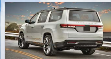
Jeep Wagoneer / Grand Wagoneer concept reveal

miles in full EV mode—all Trail Rated, with the solid axles, full-time transfer case, extreme suspension and 30 inches of fording you'd expect.