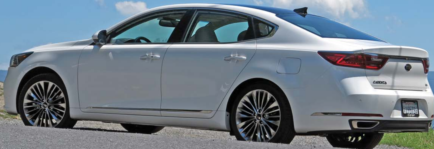
The 2017 Kia Cadenz pauses high above Virginia's beautiful Shenandoah River Valley.