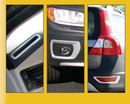
60 • May-June 2008 • ARIZONADRIVER

We had all good weather for our time with the XC70, so we didn't experience all-wheel traction on wet, but on mild dirt/gravel, it makes the transition and holds its path as well as any road-intended all-wheel-driver. In all, with large cargo area, clever additional gear stowage, a comfortable all-conditions ride, great instruments and respectable power, all at a competitive price, we'd find this a keeper.