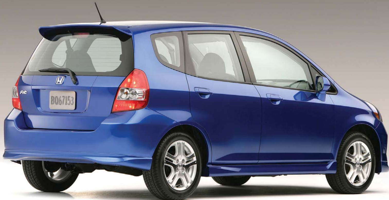
Perhaps less distinctive than the front view, the rear of the Honda Fit Sport nonetheless features very well-executed fit, finish, utility and design detail.