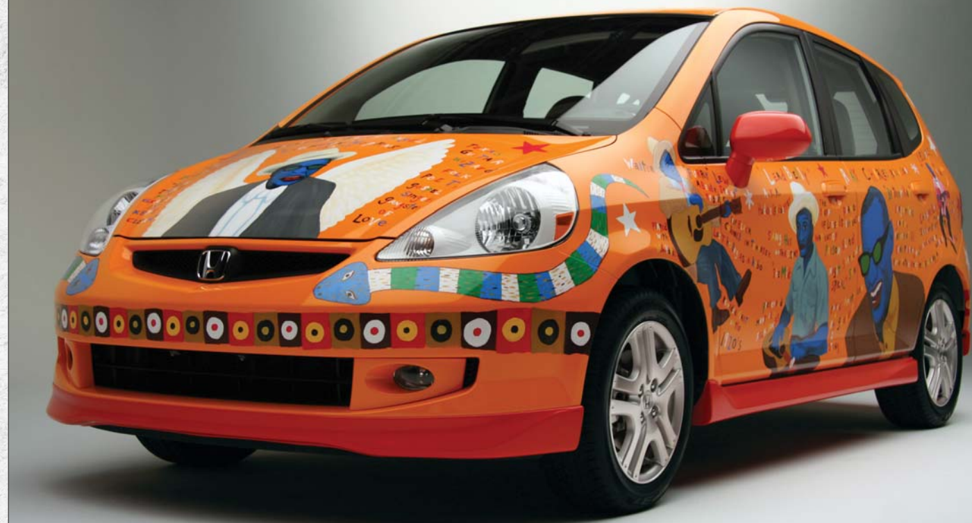
Honda teamed with House of Blues Entertainment to create this one-of-a-kind Fit for a summer charity auction. Can major SEMA efforts be far behind?