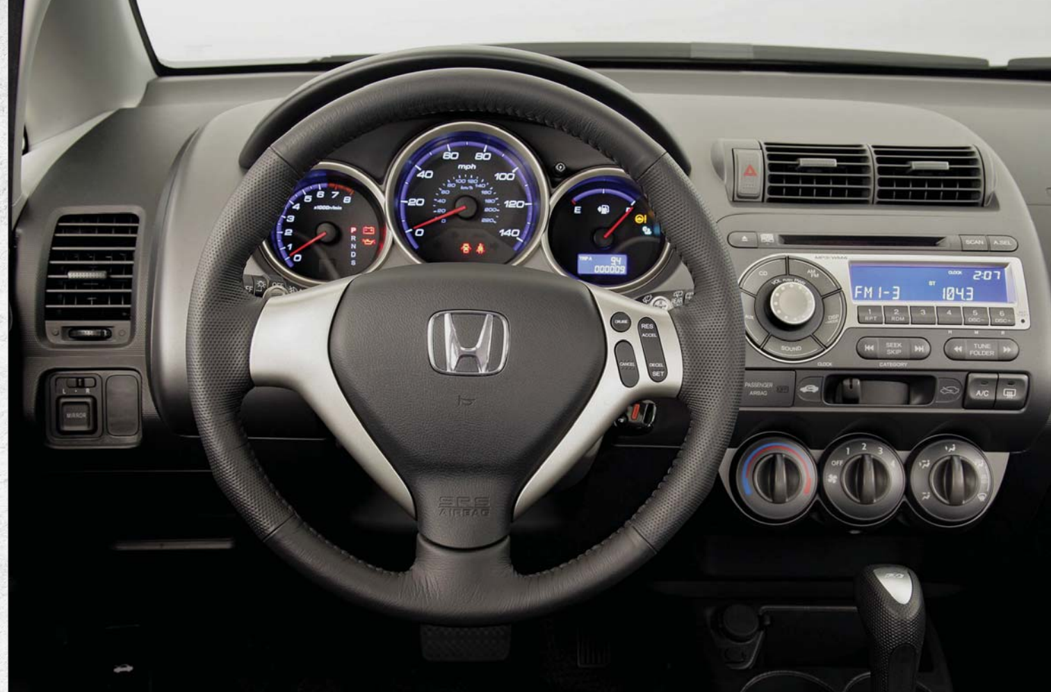
Hop behind the wheel of the Honda Fit Sport, and you will find not only a comfortable cabin, but 5-speed paddle shifter, MP3 connectivity and more.

W ith one eye on the gas gauge, one on the wallet, and a third on what's coming down the pike, literally and figuratively, we looked forward to our week with the Honda Fit with great anticipation.