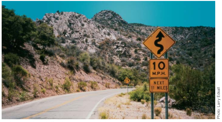
■ The Coronado Trail offers hairpin curves and elevation changes, a great workout for the six-speed

The interior has some nice touches that could go unnoticed on short drives. For