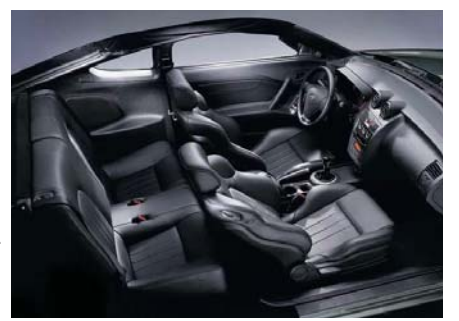
■ The Tiburon boasts changes inside and out.

We took a day and did a nearly 600-mile drive, heading east from Phoenix on US 60, then turning off at Globe on US 70